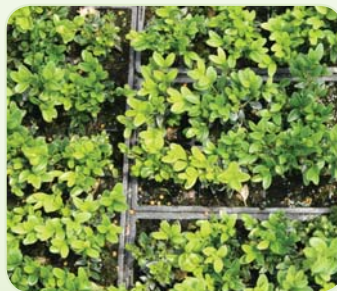
After BioWeed™ application.

Wiseman Nursery Manager, Eddy Giling uses BioWeed™ to effectively and safely clean up potted English Box before sale.