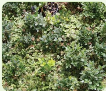
Before BioWeed™ application.

Before using BioWeed™ Wiseman Nurseries required a team of staff to clean off the Liverwort from the soil surface prior to sale.